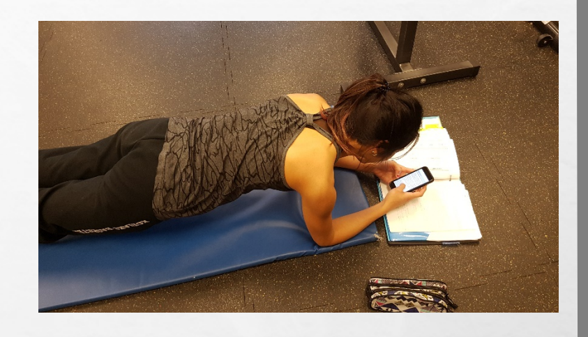
What's your excuse?